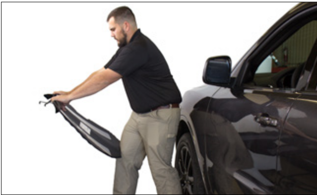
▲ Figure 8. Bending the ballistic door panel

NOTE: Do not bend the ballistic door panel tighter than a 6" radius (12" diameter).