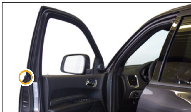
▲ Figure 6. Outer window weatherstrip screw