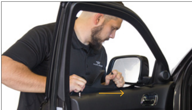
▲ Figure 12. Sliding ballistic door panel forward

⚠ Work the ballistic door panel forward firmly to clear any obstructions, but never use excessive force, which may damage internal door components or cause visible external damage to the door. It may be useful to shimmy the ballistic door panel side to side while pushing forward.