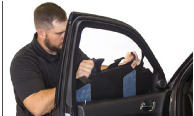
▲ Figure 10. Inserting ballistic door panel

⚠ Leaning back while inserting the panel into the door is a critical installation step; not following the process outlined above may cause exterior damage to the door.