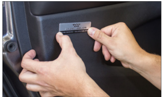
▲ Figure 15. Applying the Angel Armor brand label