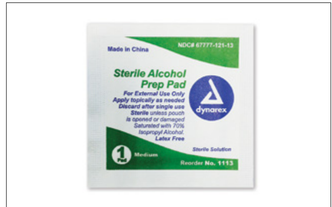
▲ Figure 4. Isopropyl Alcohol Wipe