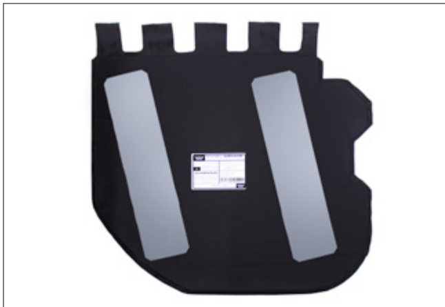
▲ Figure 2. Angel Armor Ballistic Door Panel (Level IIIA) for Dodge® Durango Special Service