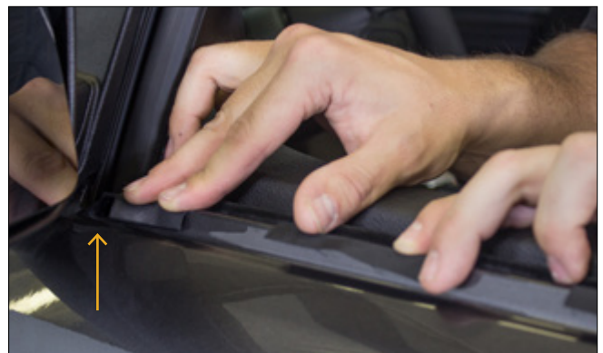
▲ Figure 13. Verifying the panel is 1/4 - 1/2 inch from the front of the window frame

NOTE: If excessive nylon is exposed above the door and the crease does not align with the top edge of the window frame, remove the panel and repeat steps 1 through 5 of this section. Avoid tearing the ballistic door panel's weatherproof cover on the "teeth" inside of door by pushing the panel toward the interior of the vehicle before lifting it out of the door.