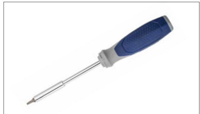
▲ Figure 5. Torx T-20 Screwdriver