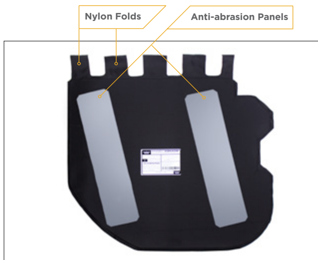
▲ Figure 1. Avail Ballistic Door Panel (Level IIIA) for the Dodge Durango Special Service Front Doors. Front of panel displayed.

In just a matter of minutes, your vehicle will be upfitted with the finest ballistic technology available. With innovative ballistic materials, advanced designs and the fastest installation in the industry, Avail Ballistic Door Panels elevate protective technology to a higher level.