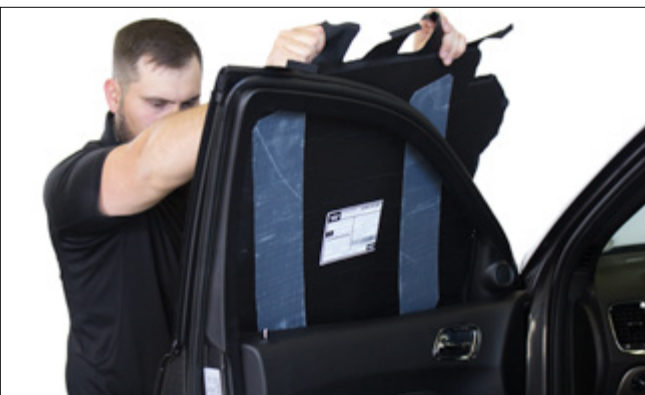
▲ Figure 9. Final placement of installation tool