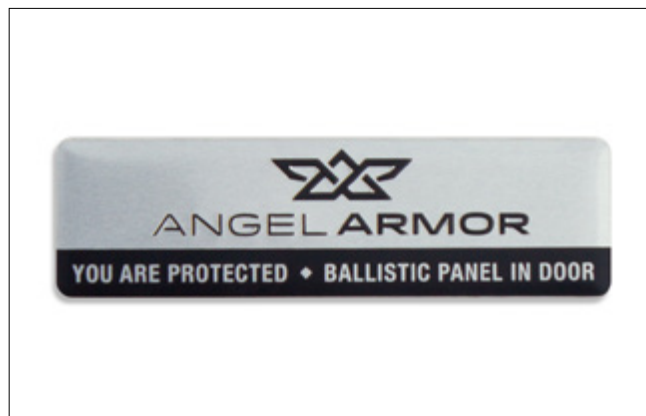
▲ Figure 3. Angel Armor Brand Label