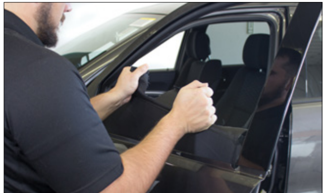
▲ Figure 11. Leaning back/pulling ballistic door panel toward exterior of the door

⚠ Leaning back while inserting the panel into the door is a critical installation step; not following the process outlined above may cause exterior damage to the door.