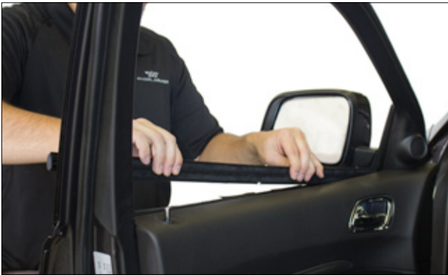
▲ Figure 14. Replacing the window weatherstrip