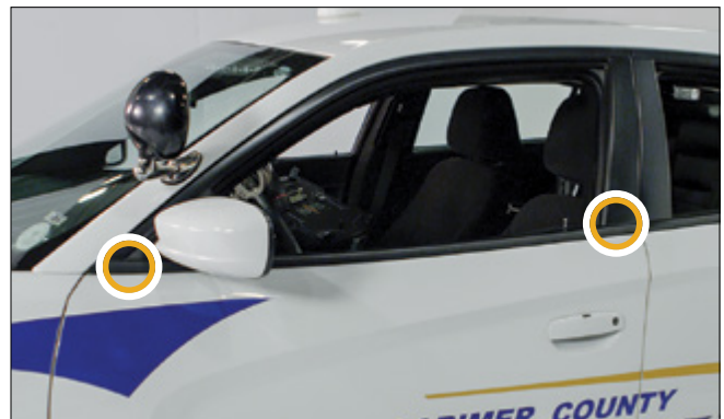
▲ Figure 6. Outer window weatherstrip screws