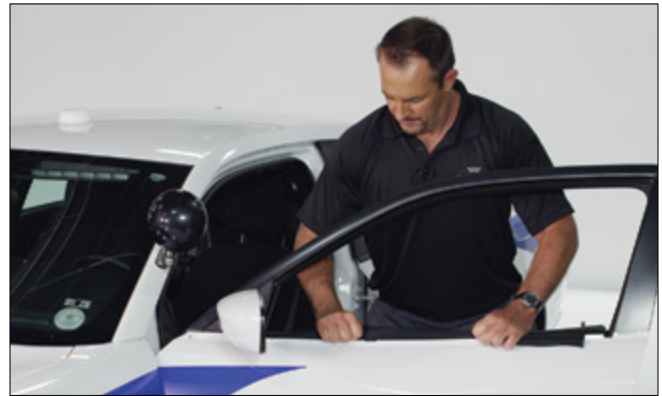
▲ Figure 9. Gripping Ballistic Door Panel's top-edge nylon folds