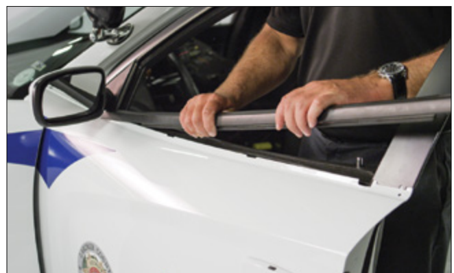
▲ Figure 7. Removing outer window weatherstrip