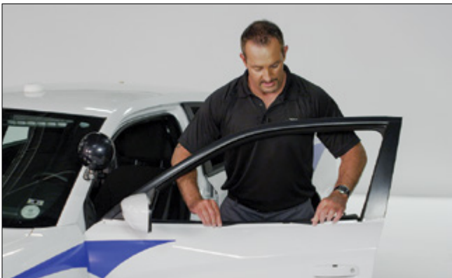
▲ Figure 10. Proper alignment of crease with window frame

NOTE: If excessive nylon is exposed above the door and the crease does not align with the top edge of the window frame, remove the panel and repeat steps 1 through 8 of this section. Avoid tearing the Ballistic Door Panel's weatherproof cover on the "teeth" inside of door by pushing the panel toward the interior of the vehicle before lifting it out of the door.