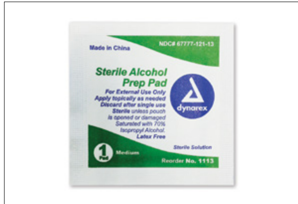
▲ Figure 5. Isopropyl Alcohol Wipe