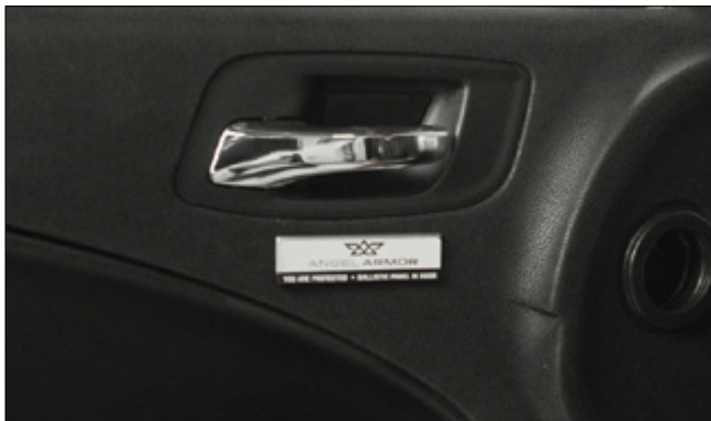
▲ Figure 12. Attaching Angel Armor brand label