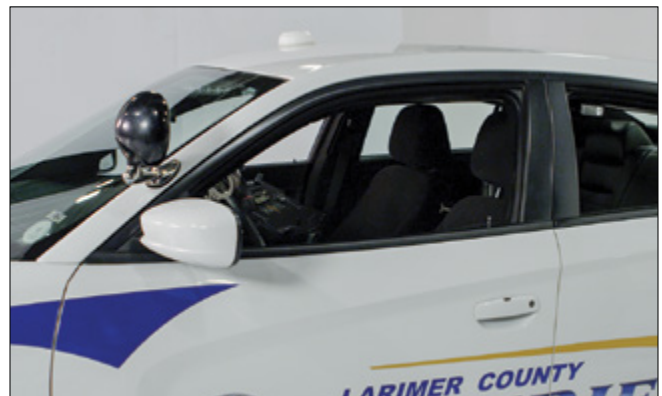
▲ Figure 11. Exterior view of properly installed Ballistic Door Panel