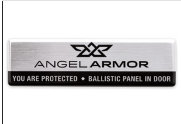
▲ Figure 4. Angel Armor Brand Label