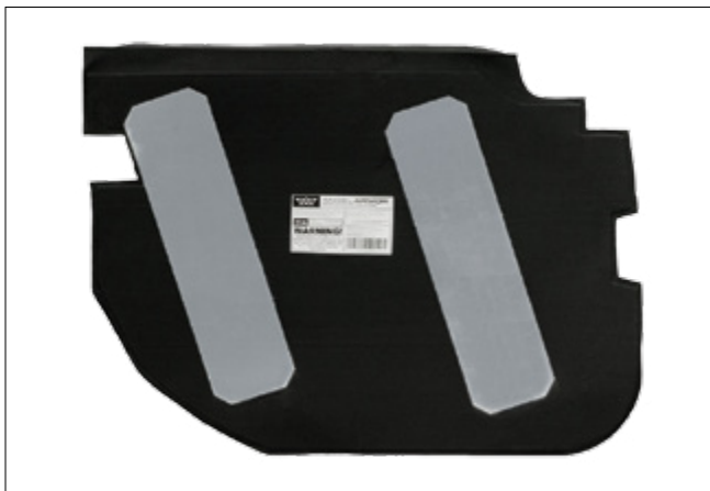
▲ Figure 3. Angel Armor Avail Ballistic Door Panel (Level IIIA) for Dodge® Charger Pursuit