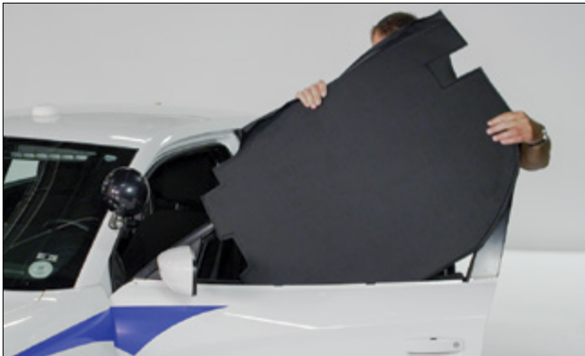
▲ Figure 8. Inserting the Ballistic Door Panel into the door

NOTE: To give visual perspective, Figure 6 shows the installer standing on the inside of the door. However, we recommend standing on the outside of the door when completing step 2 to minimize the possibility of external damage to the door.