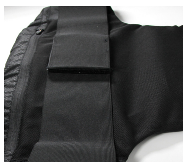
*Belly Band upgrade shown