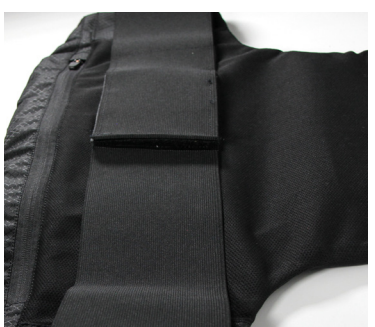
*Belly Band upgrade shown