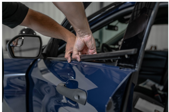
▲ Figure 6. Removing the window trim