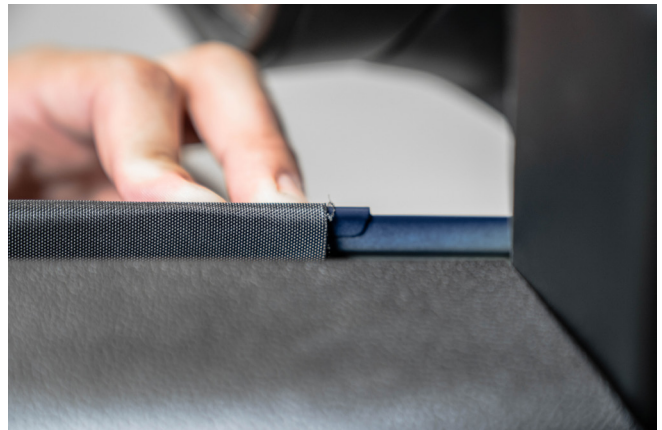
▲ Figure 9. Proper alignment of nylon fold with window frame