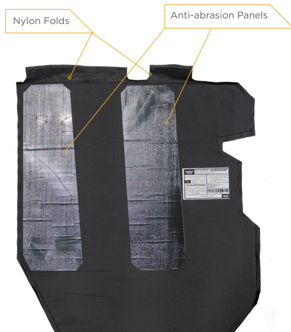
▲ Figure 1. Angel Armor Ballistic Door Panel (Level IIIA) for the Ford® Interceptor Utility Vehicle

In just minutes, your vehicle will be upfitted with the finest ballistic technology available. With innovative ballistic materials, advanced designs, and the fastest installation in the industry, Angel Armor Ballistic Door Panels elevate protective technology to a higher level.