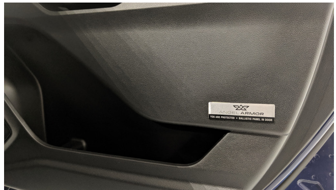
▲ Figure 11. Attaching Angel Armor brand label