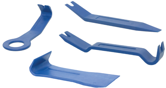
▲ Figure 3. Panel/trim removal tools