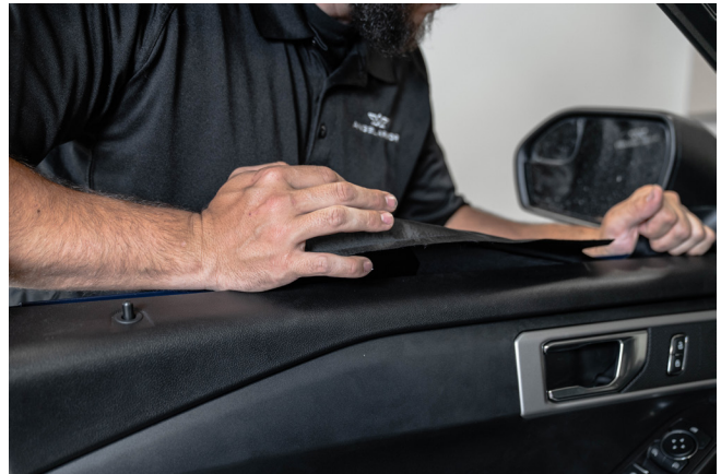
▲ Figure 8. Gripping ballistic door panel's top-edge nylon folds

7 Grip the nylon folds at the top of the ballistic panel when the ballistic panel is inserted the majority of the way down into the door.