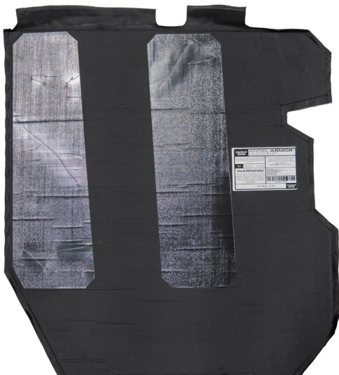
▲ Figure 2. Angel Armor ballistic door panel (Level IIIA) for the Ford® Interceptor Utility Vehicle