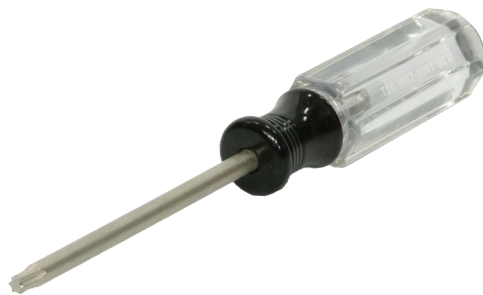
▲ Figure 4. Torx T20 screwdriver