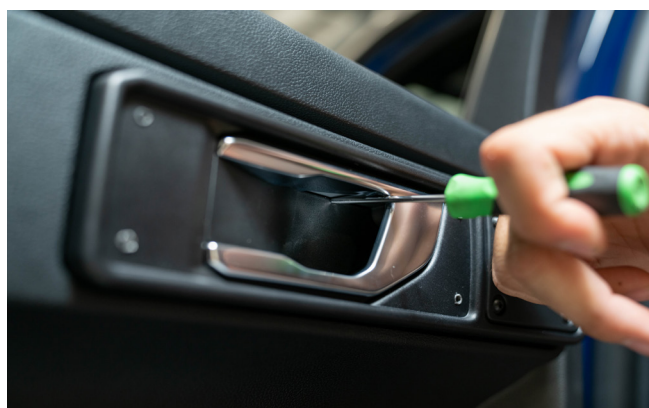
▲ Figure 13. Removing the trim cover.