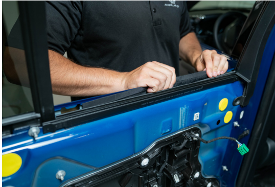
▲ Figure 23. Leaning back/pulling ballistic door panel toward exterior of the door.