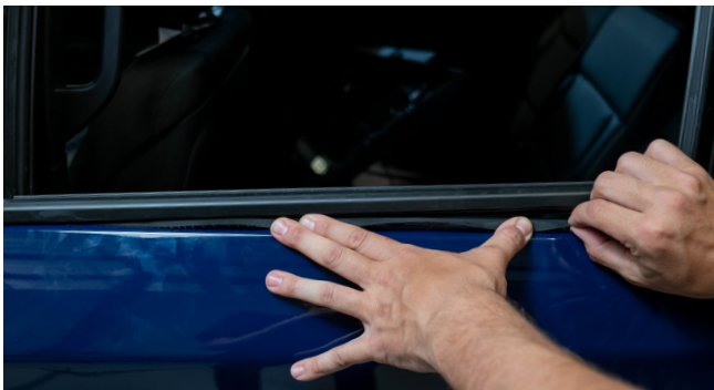
▲ Figure 25. Exterior view of properly installed ballistic panel