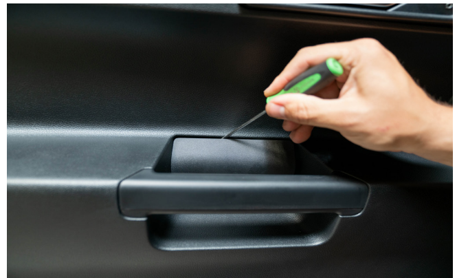
▲ Figure 15. Removing the trim cover.