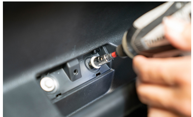
▲ Figure 16. Removing the 2 10mm screws.