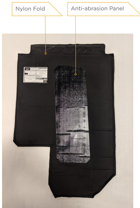
▲ Figure 1. Angel Armor Ballistic Door Panel (Level IIIA) for the Ford® Interceptor Utility Vehicle

In just minutes, your vehicle will be upfitted with the finest ballistic technology available. With innovative ballistic materials, advanced designs, and the fastest installation in the industry, Angel Armor Ballistic Door Panels elevate protective technology to a higher level.