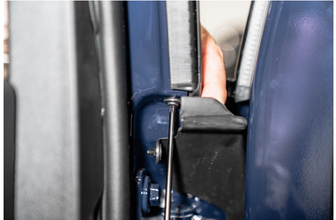
▲ Figure 9. Removing the Torx screw.

3 Remove the Torx screw at the front end of the outer window weatherstrip.