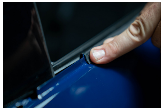
▲ Figure 24. Verifying the panel is 2 inches from the front of the window frame