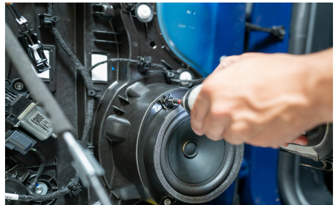
▲ Figure 18. Removing screws that hold the speaker.