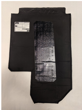
▲ Figure 2. Angel Armor ballistic door panel (Level IIIA) for the Ford® Expedition SUV Vehicle