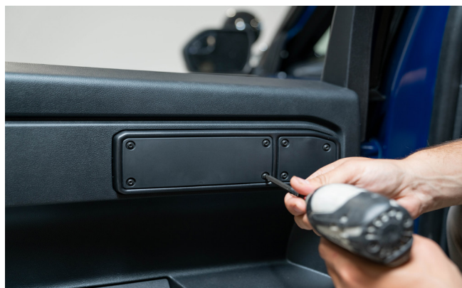
▲ Figure 12. Removing the four T20 screws.