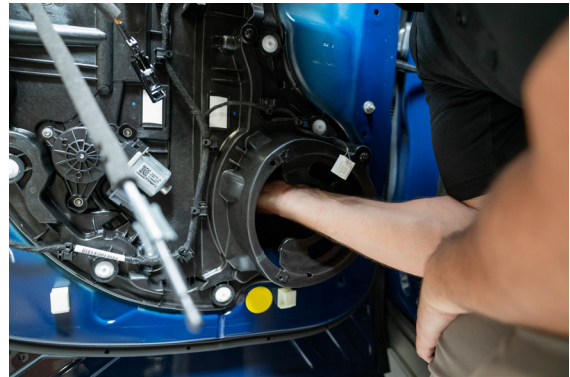
▲ Figure 20. Reaching into door to lead the bottom of the panel.