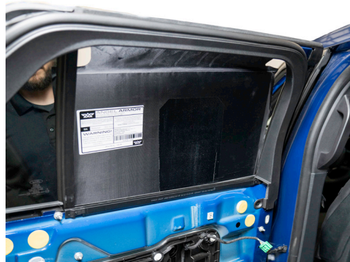
▲ Figure 19. Inserting the panel into the door.

⚠ Do not force the panel past crash bar and wiring harness.