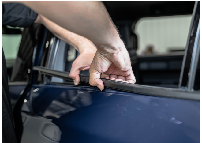
▲ Figure 10. Removing the window trim

4 Lift up the front end of the weatherstrip and slide it out.