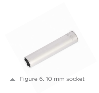
▲ Figure 6. 10 mm socket