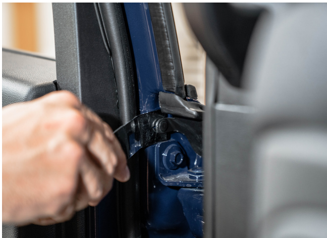
▲ Figure 8. Prying the plastic trim retainer.

3 Remove the Torx screw at the front end of the outer window weatherstrip.