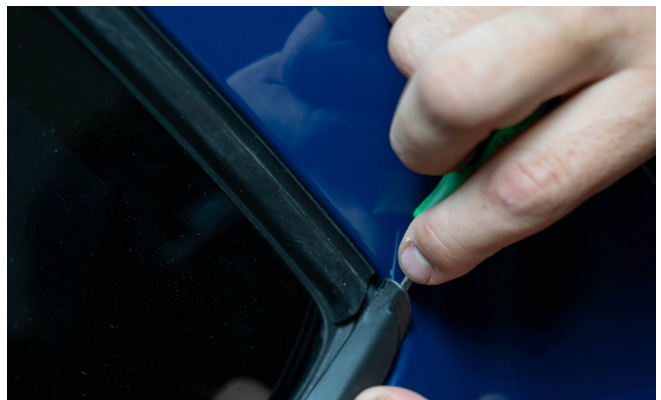
▲ Figure 11. Disconnecting rear weatherstrip clips.

5 Use a small flat blade to disconnect rear weatherstrip clips