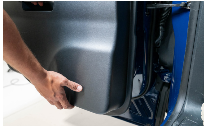
▲ Figure 17. Prying open the vehicle interior door trim panel