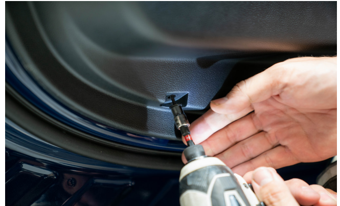
▲ Figure 14. Removing the 2 7mm screws.