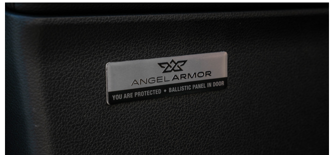
▲ Figure 26. Attach Angel Armor brand label